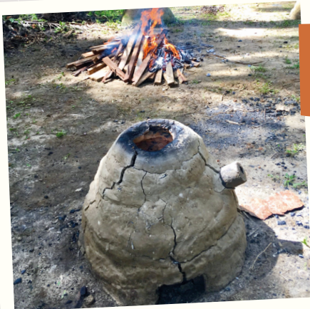
Sungai Batu Archaeological Site