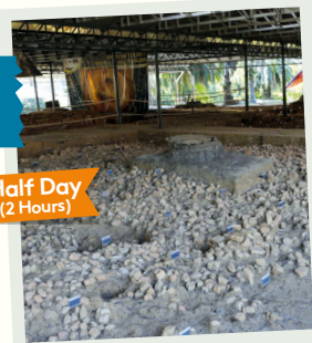
Sungai Batu Archaeological Site