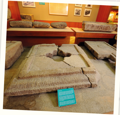
Bujang Valley Archaeological Gallery

Explore Sungai Batu, an archaeological site in northern Malaysia, and it holds the ruins of several Animism-Hindu-Buddhist temples. The site, which is located at Merbok in Kedah, is believed to have existed since 788 BC. It was once a thriving international entrepot, an iron smelting hub, as well as a religious centre. A lot of activities will be conducted such as Sungai Batu archaeological tour, visit to Bujang Valley Archaeological Gallery, archaeological excavation demonstration, and hands-on brick making and iron smelting demonstration before heading to Mount Jerai for dinner and check-in Hotel.